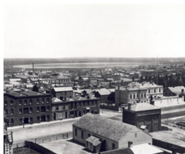
Unknown maker View to Batmans Swamp 1869 facsimile of photograph 43 x 52.5cm

A vastly different view can be seen in the nineteenth century photograph titled View to Batman's Swamp . The waterhole in this image was part of a large wetland area and saltwater blue lake that spanned between Footscray and North Melbourne.