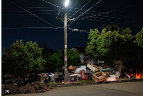
Anna Kiparis Aftermath, Maribyrnong 2022 pigment ink on cotton rag 55 x 78cm

Following the Maribyrnong flood in 2022, Anna Kiparis photographed the devastating effects of this natural disaster on the community. In Aftermath, Maribyrnong , flood-damaged belongings are piled high on the nature strip, contrasted by large green trees illuminated by a single lamppost.