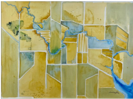
Chrisy Dennis Maribyrnong River, Tributaries to the Sea 1988 watercolour on paper 80 x 97.5cm

Adopting this concept and applying it through a contemporary lens, Encounters brings a diverse array of works from the City's Collection into dialogue. From heritage regalia to contemporary ceramics, works across mediums, time periods and styles are connected and interweaved. By blurring boundaries, the exhibition invites viewers to explore local narratives, shifting values and relationships across time.