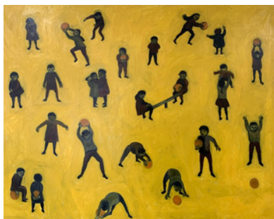
Annie Howie Yellow Chorus 1984 oil on canvas 100 x 137cm