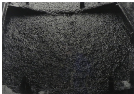
Viv Méhes Big River (The A.M Vella Dredging the River 03) 1995 silver gelatin print 69 x 87cm

Soon afterwards came to a large river; went up it about a mile when we turned back and waited for the boat to take us on board. The ground is a swamp on one side and high on the other. Saw many swans, pelicans, and ducks. Were obliged to go up to our middle to get to the boat, and got on board between five and six o'clock.