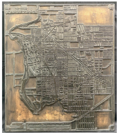
Unknown maker Printing Block City of Footscray unknown date zinc plate on wood 73.5 x 63cm