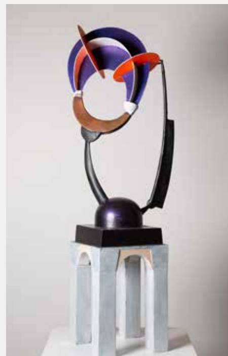
An example of the statue, Maribyrnong .

The design was selected as part of the Boat House Public Art Commission through an open and competitive two-part process, which received 39 high calibre submissions from across Australia. The artwork will become part of the City of Maribyrnong's Art and Heritage Collection and was funded by Boat House Developer Jubilee Apartments.