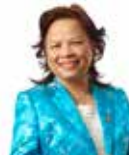
CR CUC LAM

Email: cr.cumming@maribyrnong.vic.gov.au Ph: 0417 390 658