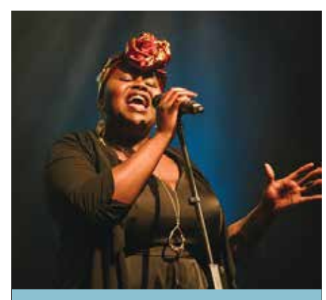
JAZZ OUT WEST – MELBOURNE INTERNATIONAL JAZZ FESTIVAL

SATURDAY 1 JUNE YARRAVILLE POP UP PARK, YARRAVILLE