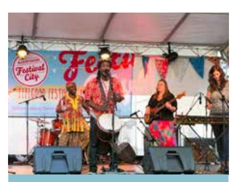
EMERGE IN THE WEST