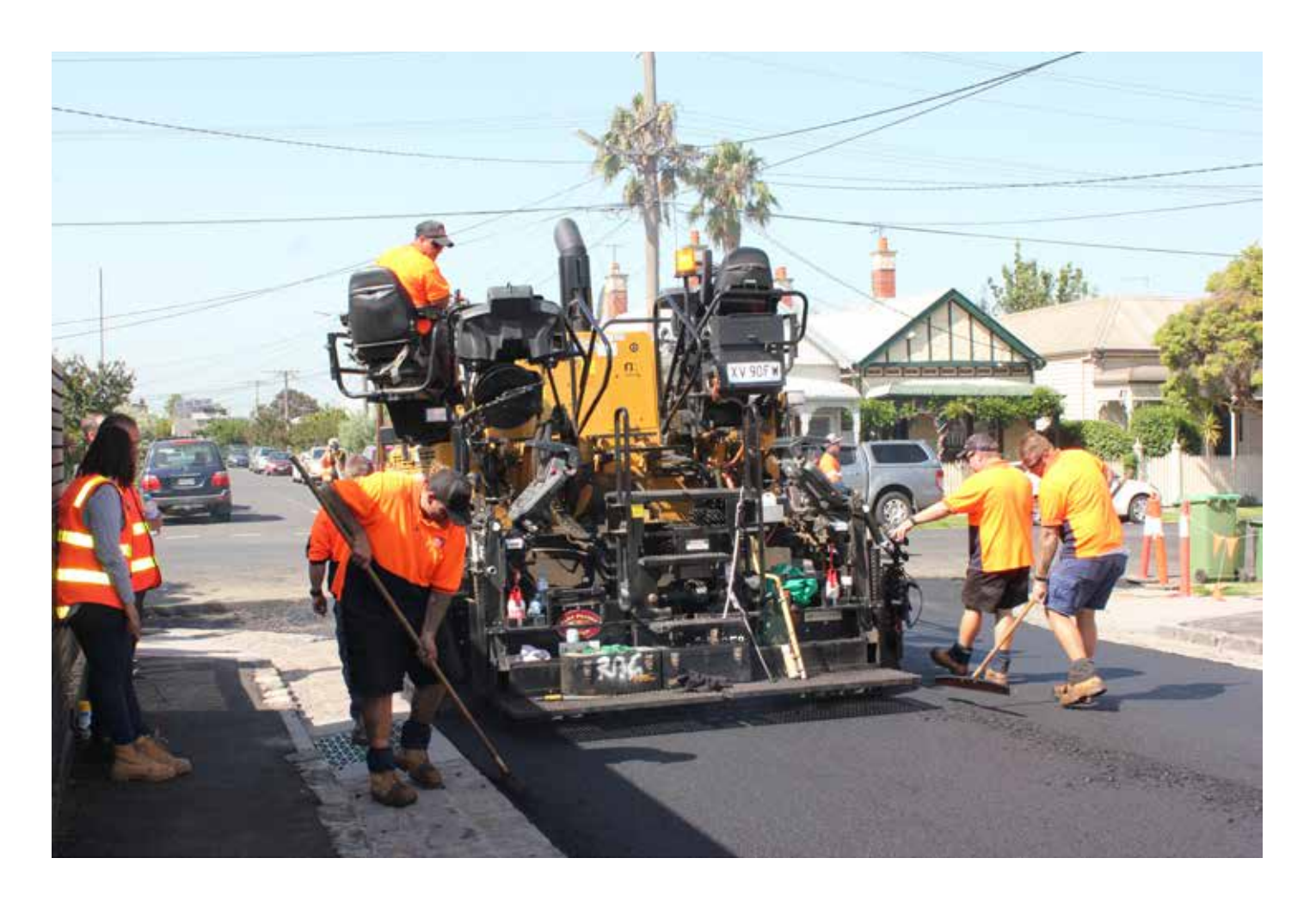
As part of a new trial, Harriet Street in Seddon has been resurfaced using a more sustainable and durable asphalt known as PolyPave, which incorporates recycled materials.

Made up of glass and plastic bottles, PolyPave also uses a warm mix asphalt with reclaimed asphalt pavement (RAP). RAP is made from old road pavement that has been broken down and recycled into new asphalt mix. The warm mix application requires less heating than the traditional hot mix application, resulting in a lower carbon footprint. It also makes the roads more hard wearing and is less sensitive to increased pavement temperature.