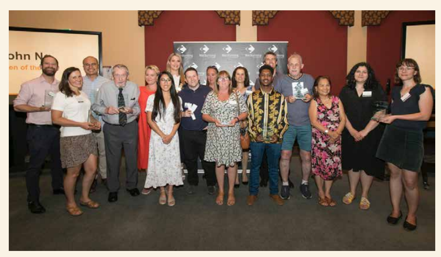
Our 2020 Civic Award winners.