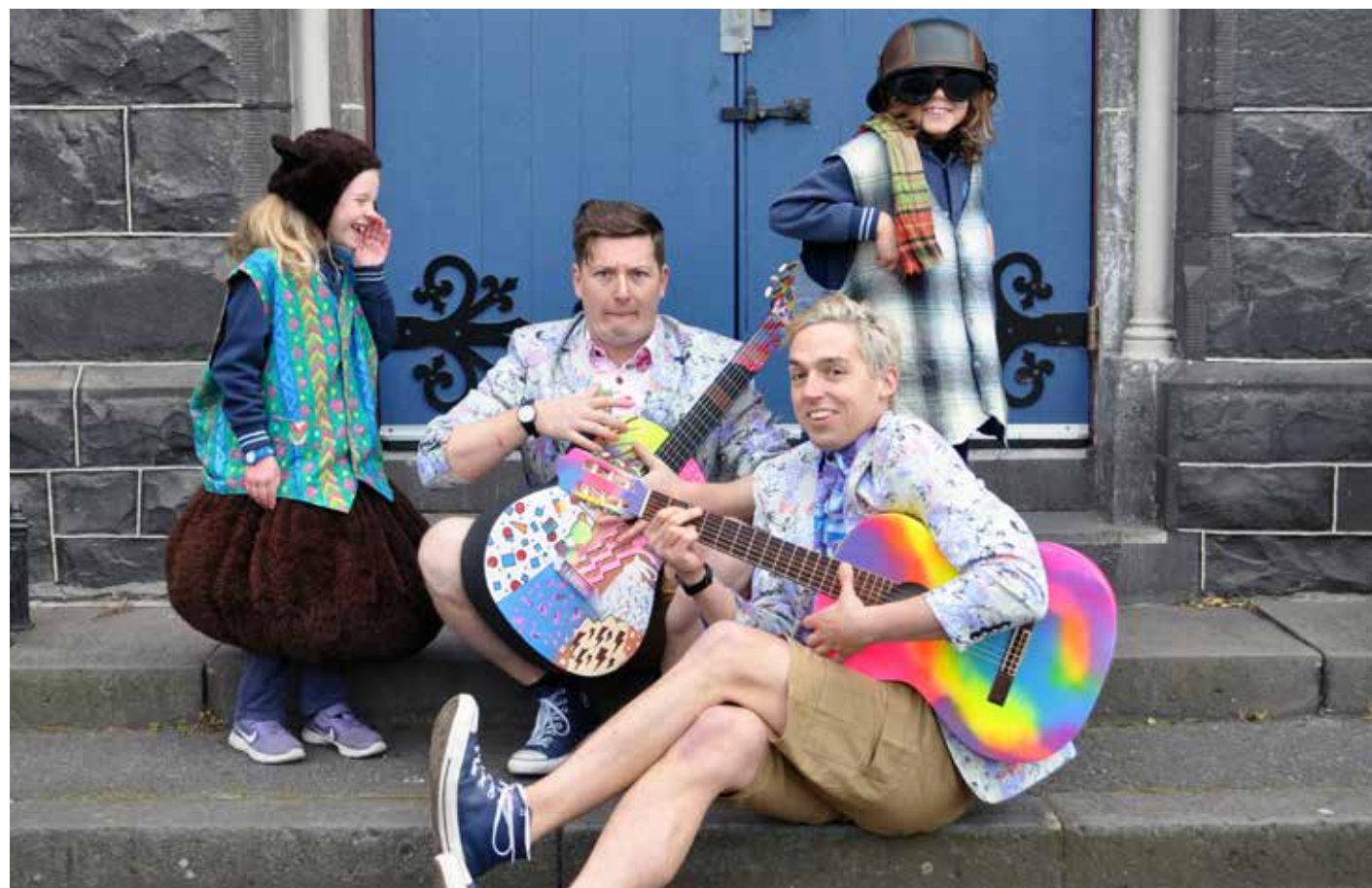
VIEW THE WORLD FROM A DIFFERENT ANGLE THIS SEPTEMBER AS MELBOURNE FRINGE VENTURES WESTSIDE

The inner west is a unique and thriving cultural hub, with a dynamic and progressive culture that reflects the creativity of those living and working in the west. After five successful years of presenting Fringe Out West as part of the Festival, this year Council is partnering with Melbourne Fringe to bring the City of Maribyrnong an artistic and cultural experience like no other.