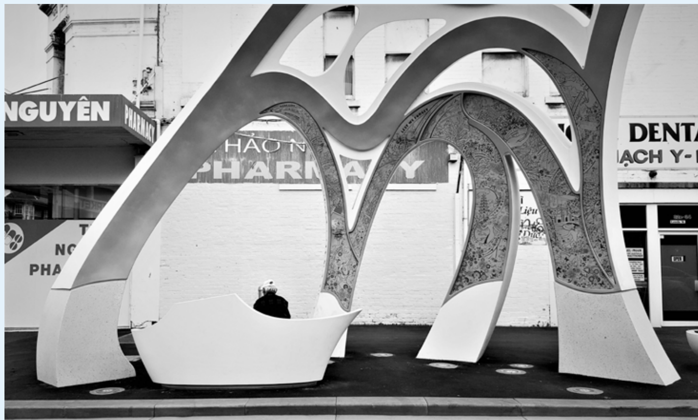
FIRST PRIZE – $3000 worth of photographic related vouchers. Ralph Uy, Footscray Saigon Welcome Arch

This competition turned the spotlight on our City's wonderful photographers. We received nearly 400 entries which, in keeping with the theme, focussed on places and viewpoints that photographers thought were special in the municipality. The competition was open to people who live, work or study in the municipality and winners shared a total of $6,000 in prizes.