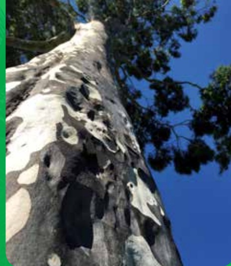
Spotted Gum in Ernie Shepard Gardens, Maidstone