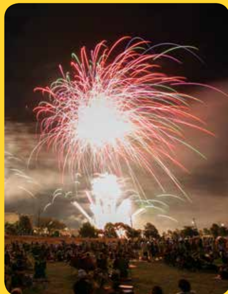
New Year's Eve