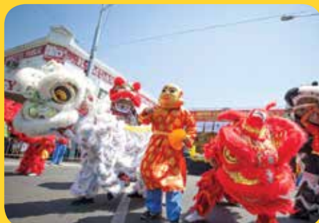
East Meets West Lunar New Year