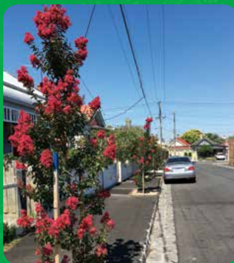
Crepe Myrtles in Junction St, Seddon

Tag us @cityofmaribyrnong and use the #MariMoments for a chance to have your photo shared on our social media channels.