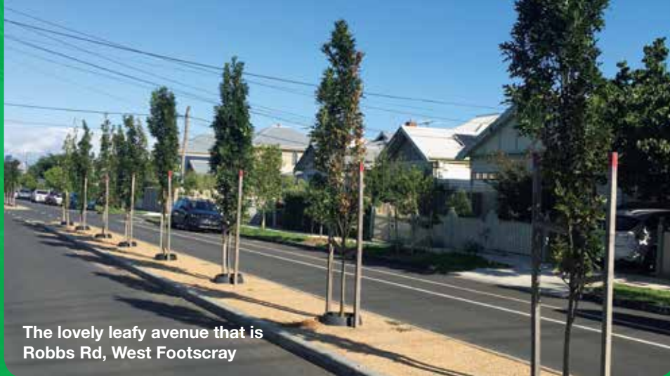
The lovely leafy avenue that is Robbs Rd, West Footscray