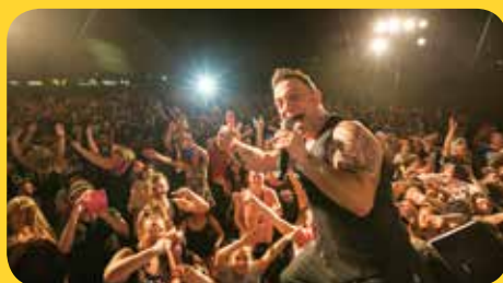
New Year's Eve