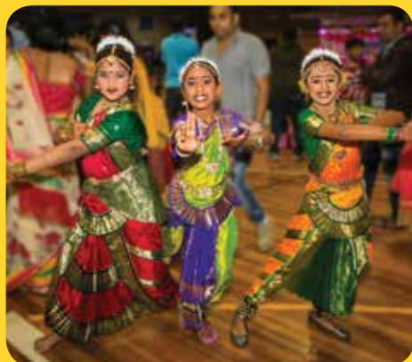
Bathukamma Festival of Flowers