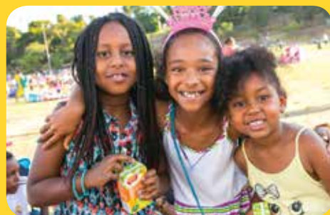
New Year's Eve