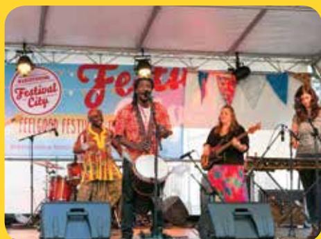
Emerge in the West