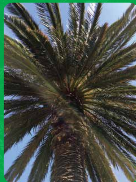
Palm tree in Johnson Reserve, West Footscray