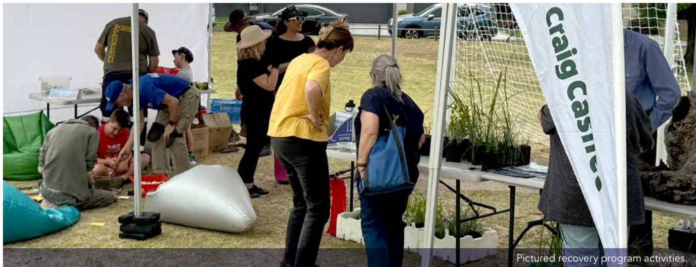
Pictured recovery program activities.