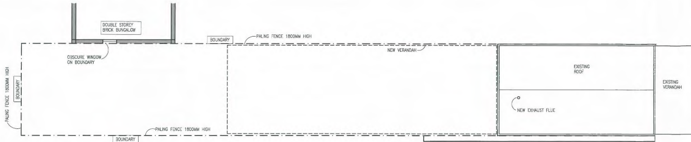
01 ROOF PLAN SCALE 1:100 PROPOSED FLOOR PLAN